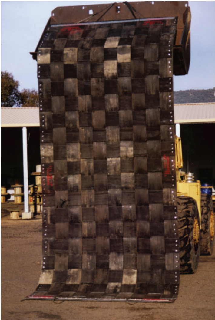
Large mat, 7000 x 3000 x 30 mm made for Leighton Contractors railway project in Queensland. That is a Cat 988 in the background holding it aloft.