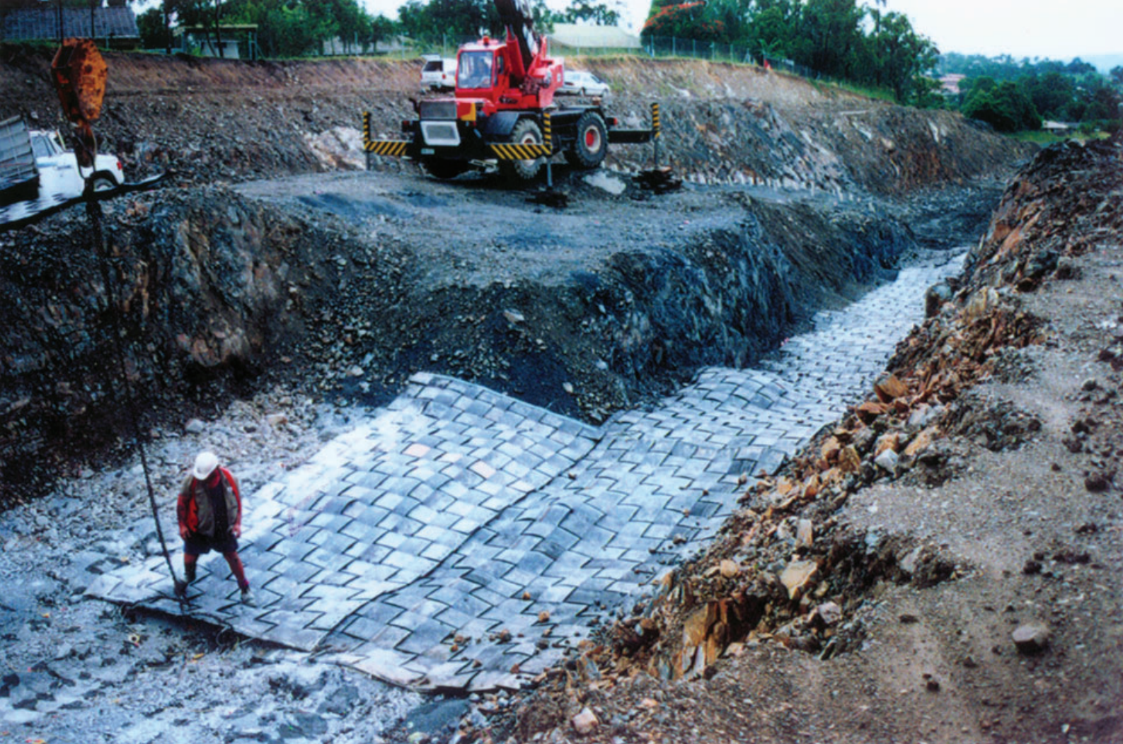
The picture shows Andromeda Blasting Mats each 7000 x 3000 x 30 mm being laid over a blast site on a railway cutting in the Brisbane area. (Leighton Project)